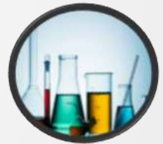
Pharma & Chemical